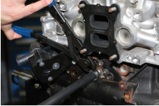
Hose Clip Pliers - for Single/Double Ear Clips | 8261